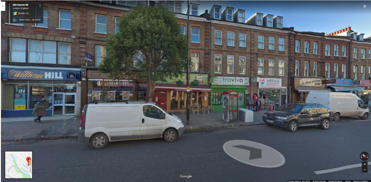
Photo of premises